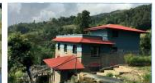
The home near Pokhara

We're also working with The Nestling Trust, which has two Nepalese Directors, to help monitor and advance our ongoing projects.