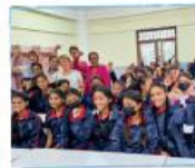
Lesson on menstrual health