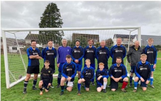
East Down Team

Another year having flown by, it was time for the Annual Boxing Day Football Match – East Down v West Down, this year the game was hosted by West Down. As alluded to in the past, this is the fixture which keeps on giving, having taken place in excess of 45 years, but it's been so long no one can remember the actual year it started!