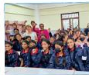
Lesson on menstrual health