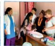
Baby weighing on the first digital scales in the district