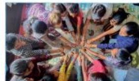
A workshop on menstrual health

Our second focus is supporting the education and vocational training of rescued girls at a children's home. The girls, aged between 9 and 17, have been rescued from the streets, having been trafficked and abandoned. These essential skills enrich their lives and give hope for a brighter future.