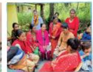
Discussion group during menstrual health workshop