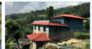
The home near Pokhara

We're also working with The Nestling Trust, which has two Nepalese Directors, to help monitor and advance our ongoing projects.