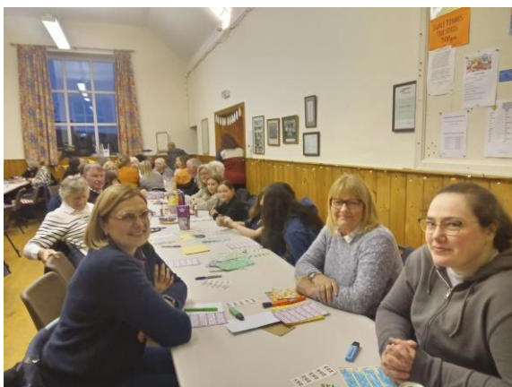
Sadly, we don't know the names of all who attended but these are people who support us each time we run a bingo night and it is always lovely to see you adding some decorum to the proceedings. Names next time ladies please!