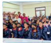
Lesson on menstrual health