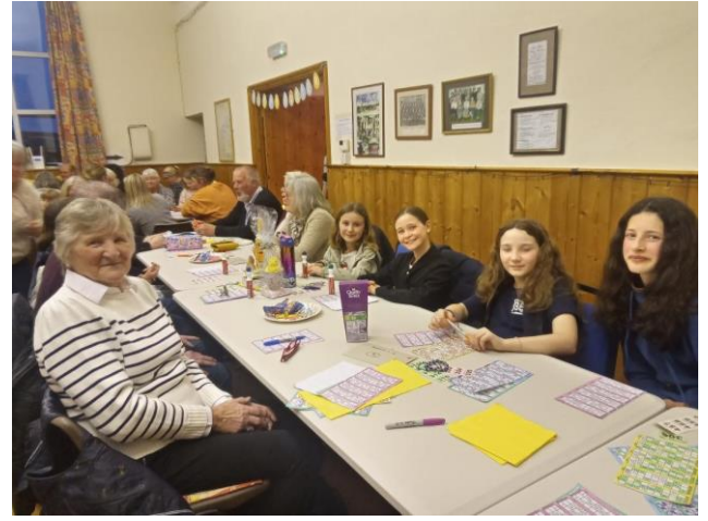
Rivalling the Lerwill/Bowden table for noise these young folk are also stalwarts who are eager to be the first to shout for a line or a full house.