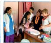
Baby weighing on the first digital scales in the district