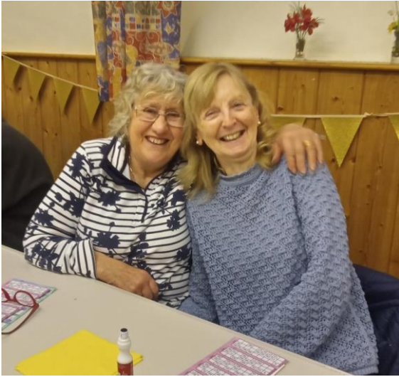
Taking a night off from kitchen and church duties, Busy Lizzie and Julie brought the glamour to the night.